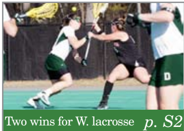
Two wins for W. lacrosse p. S2